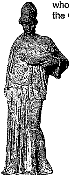
Godess Athena (or Athene)

Chorus. Greece went to pieces over the Persian war The odds were stacked against them. Just like Odysseus a thousand years before, who conquered all he saw, the Grecian heroes rose once more. (Chorus repeat)